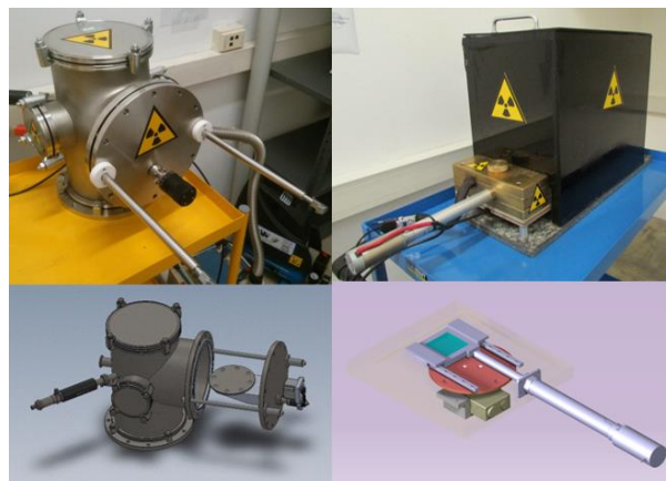
Fig. 1. On the left: \alpha irradiation system with the view of inner sample holder wheel. On the right: \beta irradiation system and its internal structure scheme.

A customised \alpha irradiation system (fig. 1) was designed, realized and optimised to evaluate the \alpha particles efficiency for each analysed object.