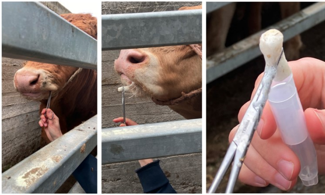
Figure 2. Bovine saliva collection.

saliva extract was subjected to LFIA (first phase) and to both EIA and LFIA determination (second phase) without any further treatments.