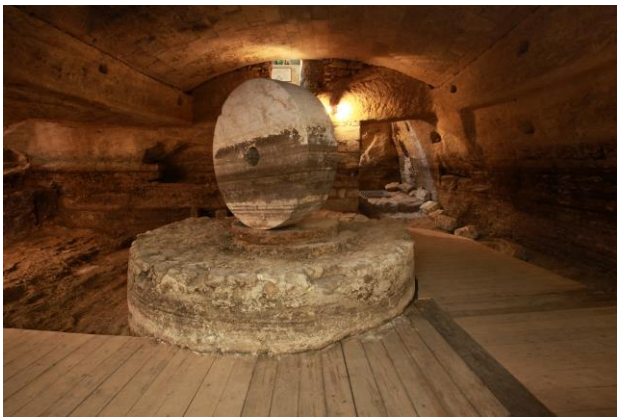
Fig.2: Real photo of the interior. The 3D survey held in high regard the “genius loci” of the real space.