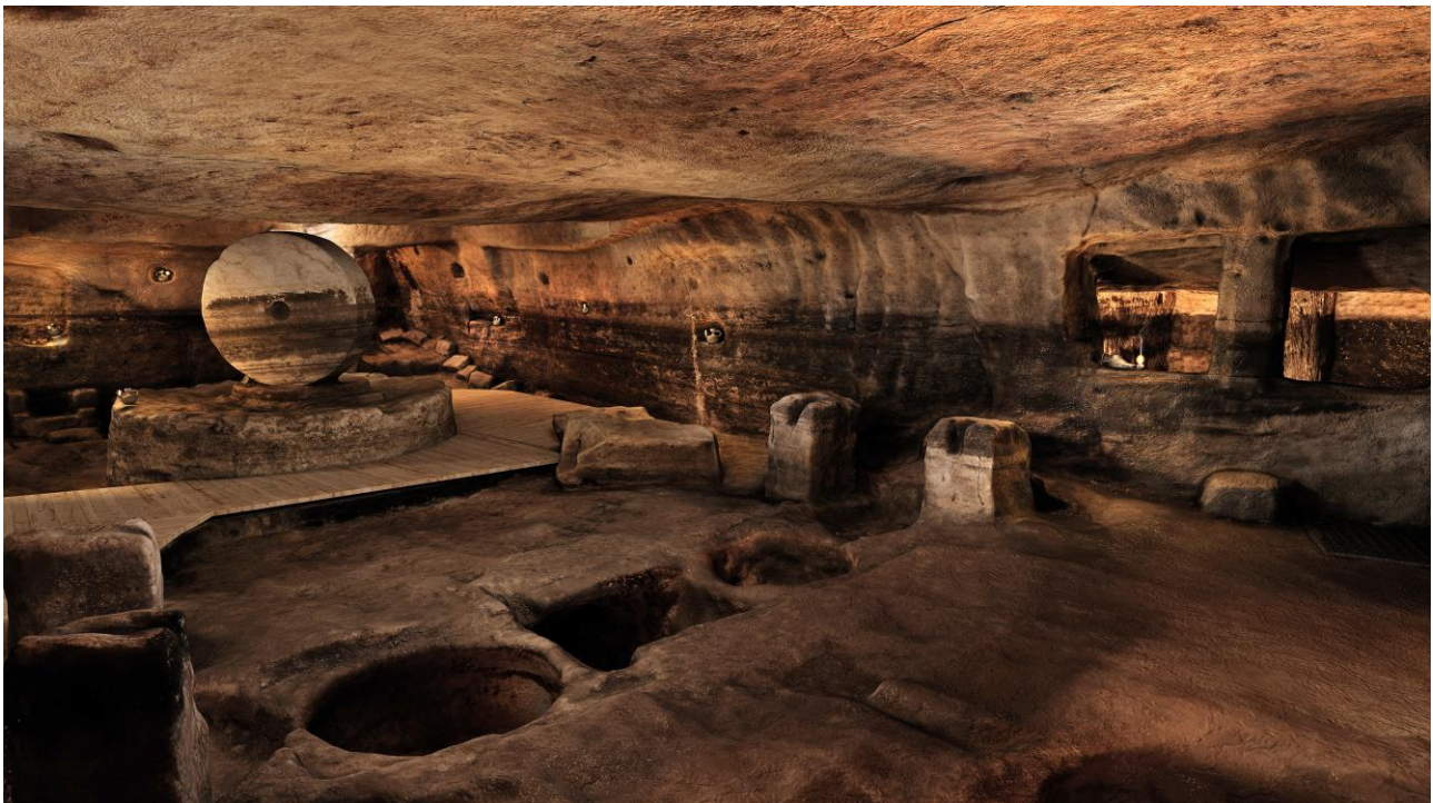
Fig. 5: The complexity of interiors and the realism guaranteed by digital photogrammetry (more of 3000 images were used).

regards the extraction machines no longer preserved, presses with one or two screws were included in the visit, taken from other similar contexts with the same 3D techniques. Since the photogrammetry ensures excellent accuracy even of the visible colours of surfaces, the 3D model is ready for all subsequent implementations that affect the state of preservation, the measurement of the volumes, the static verification in relation to the loads and road surfaces, the calculation of the needs, energy, etc. At this time our Digital Twin allows remote visit for user groups in immersive way, with the possibility of expanding the tour trip to other contexts that can follow