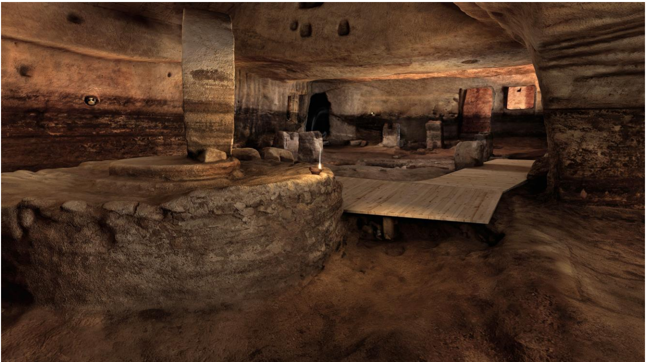
Fig. 3: 3D model based on digital photogrammetry. Here two sets of images were used, the first to obtain the 3D model and the second to ensure optimal texturing.

An example of this approach has been carried out during the COVID-19 lockdown, applied to an underground oil-mill in the town of Gallipoli (Puglia, Italy). The main and most profitable activity, which has ruled the fate of Terra d'Otranto for many centuries, has been the oil industry, carried out in over 2500 hypogeous and semi-hypogeous trappeti. In these sites only lampante oil was produced i.e. for industrial use, exported mainly to France and England, where it was used as a lubricant in wool industries and soap factories. (Monte